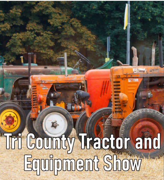
Tri County Tractor and Equipment Show